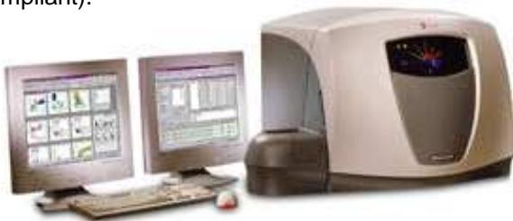
Cytomics FC500 MPL (Beckman Coulter)

Pharmacelsus measures ROS fluorochromatically in a customizable cell culture system or in a reference cell line (human monocytic leukemia). Several time points can be determined for kinetic analyses, different drug concentrations can be tested for determination of dose-response relationships. A multiplexing with other parameters such as membrane integrity is possible. Pharmacelsus uses a state-of-the-art two-laser, five-color Cytomics FC500 MPL flow cytometer (11 CFR part 11 compliant).